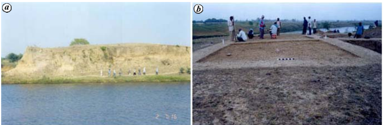
Figure 2. a, Panoramic view of the Tokwa archaeological site. b, General layout of trenches for excavation.